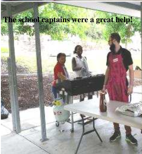
The school captains were a great help!