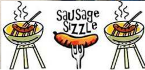
Prep class (PM) enjoying their sausage sizzle.